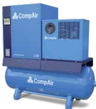
Complete airstation including compressor, dryer and receiver