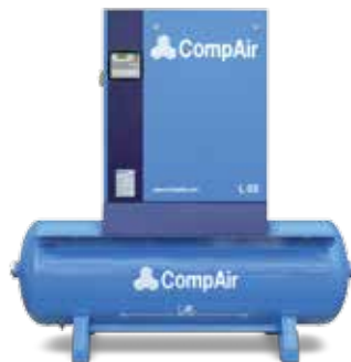
Receiver mounted compressor