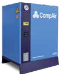
Compressor base mounted